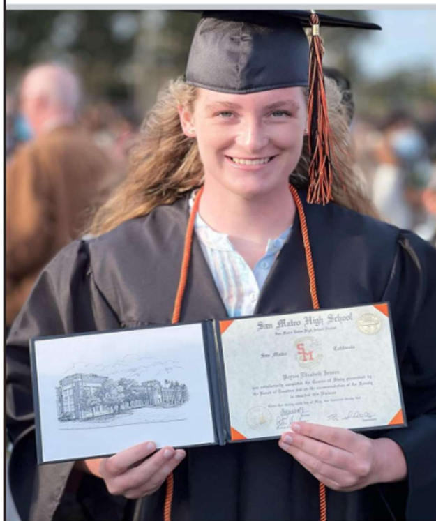
2022 – Off to college to study nursing