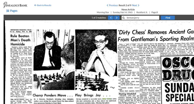
My 1st photo in a newspaper: a chess tourney

News Article Register-Republic | Wednesday, May 06, 1964 | Rockford, IL | Page:41